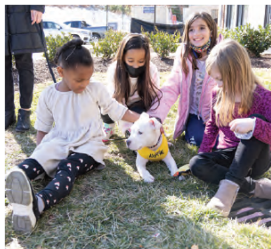
St M students enjoyed meeting Snow, a white Pit Bull puppy ambassador.

The project was featured in radio, television, print, and digital media including NBC Nightly News, The Today Show, Good Morning America, New York Times, and Southern Living. It was translated by German and Italian media, appeared in several British publications, and was featured in GeoBeats Animals, a digital media outlet that feeds content to larger news sources, racking up more than 85,000 views in its first four days.