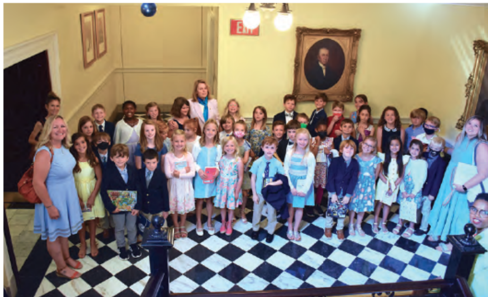
Second graders and their teachers were invited to the Virginia House of Delegates where they received a commendation and standing ovation for their project.