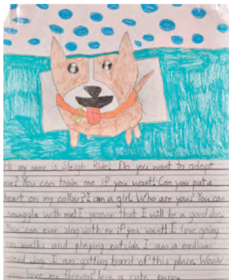
Students wrote notes from the perspective of animals and added illustrations to help the animals get adopted.