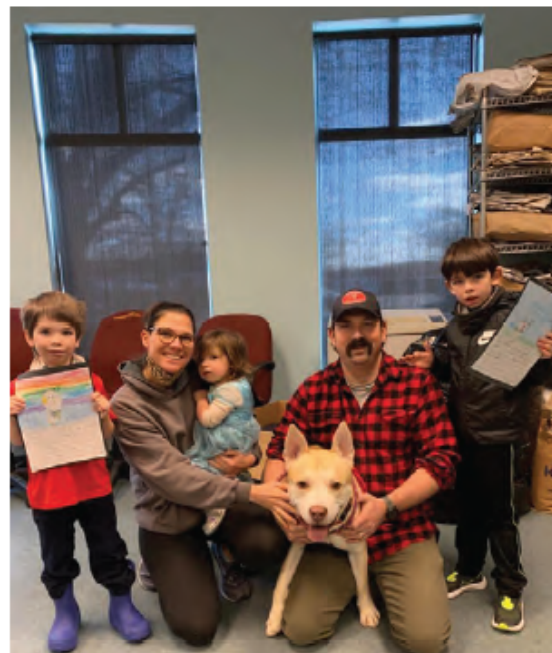
One of the families who was persuaded by the students' writings smiled with their new furry friend.